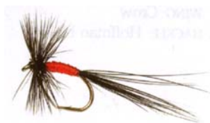
Garrett's Orange & Black

The Fly to Tie for the October 2004 Meeting is: Garret's Orange & Black (Australia's Best Trout Flies. Page 61)