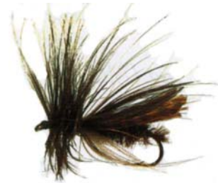
Julian Brown's Dunny Brush

Hackle: Large black cock hackle with generous number of turns